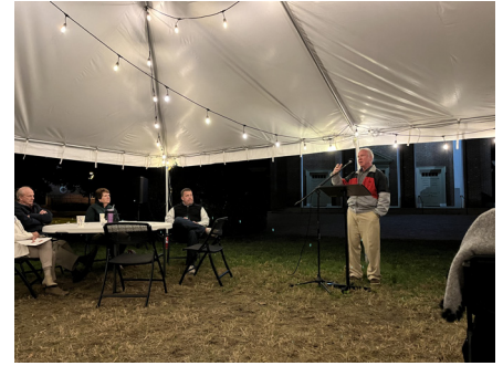
Photo from team presentation on at Wednesday Night Supper & Fellowship.