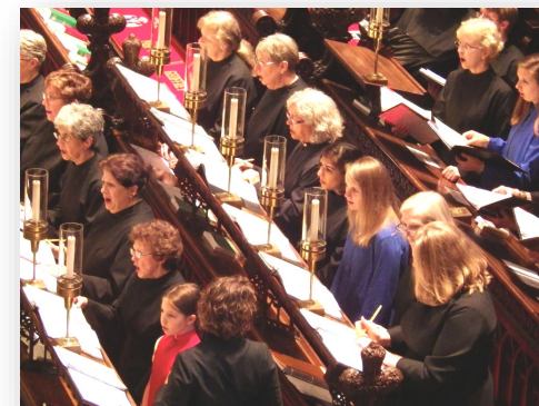
England Tour 2014 River Road Choristers singing Evensong at Canterbury Cathedral.

This choir tour will allow us to participate in the worship and prayer life of Christian churches located in the picturesque West Country of England.