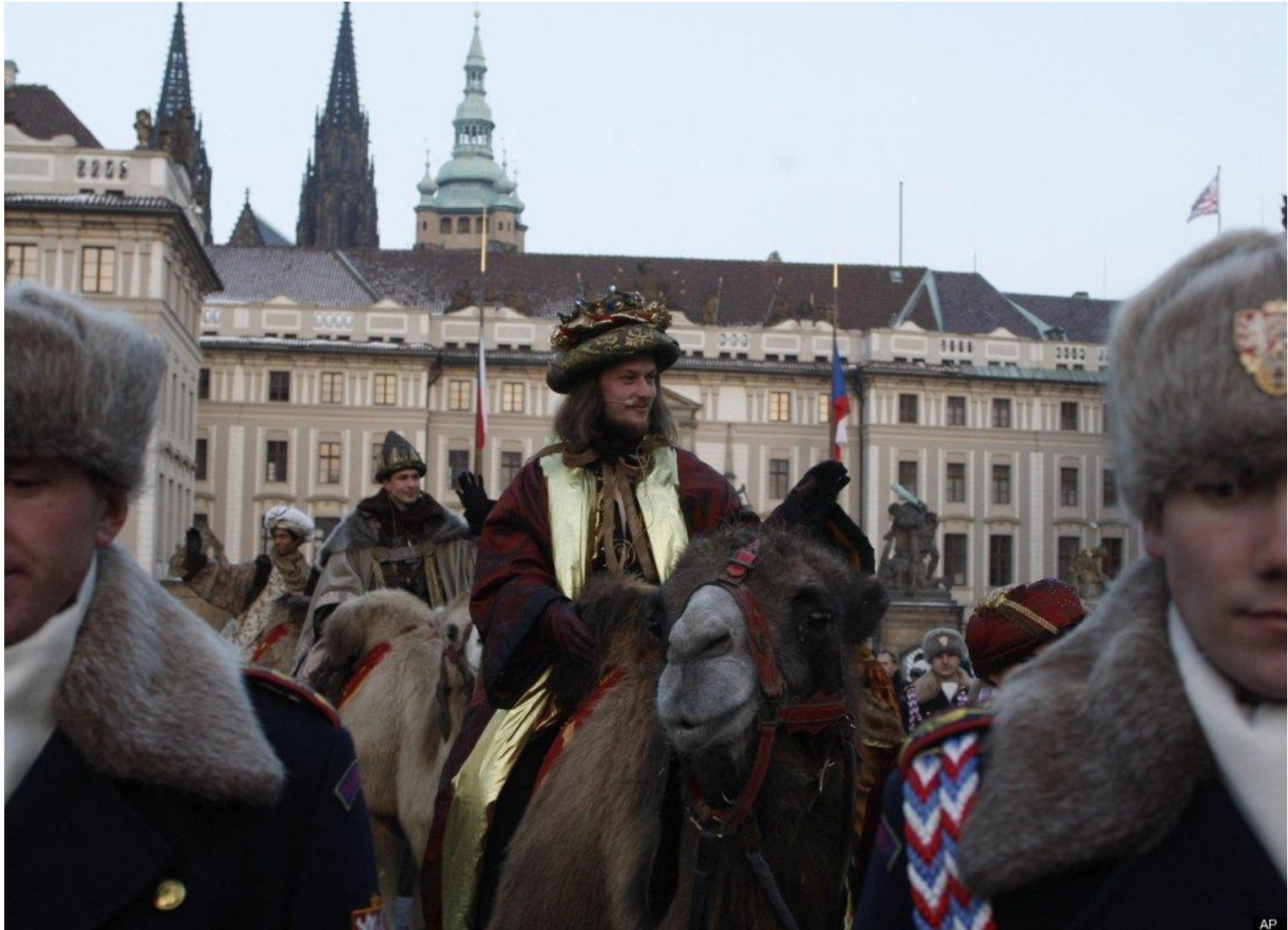
Men dressed as the Three Kings ride on camels during a procession of the Three Kings at Prague Castle.