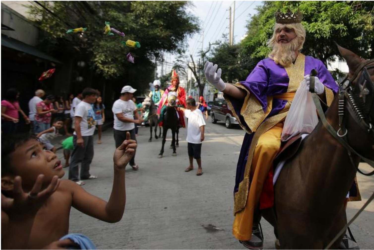
Men on horses dressed as the Three Kings throw candy to children during Epiphany celebrations Sunday along the streets of Manila, Philippines.